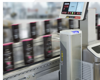
DE Dusty Environment IP54 SPA 2F-10 / SPA 2F-20 / SPA 2F-30 / SPA 2F-50 / SPA 2F-100 / SPA 2F-200