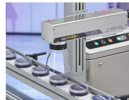
SE Standard Environment IP31 SPA 2F-10 / SPA 2F-20 / SPA 2F-30 / SPA 2F-50 / SPA 2F-100 / SPA 2F-200