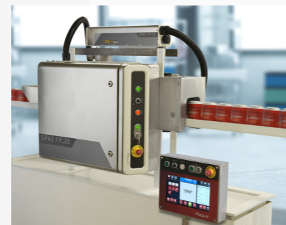
WD Washdown IP55 / IP65 SPA 2F-10 / SPA 2F-20 / SPA 2F-30 / SPA 2F-50 / SPA 2F-100 / SPA 2F-200